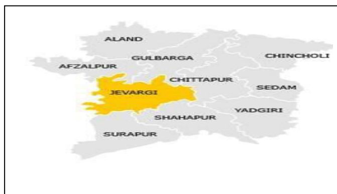
Fig.No:1 Represents the location of Jewargi town

→ According to Census 2011 There was 4083 children between age 0-6 Years in Jewargi.