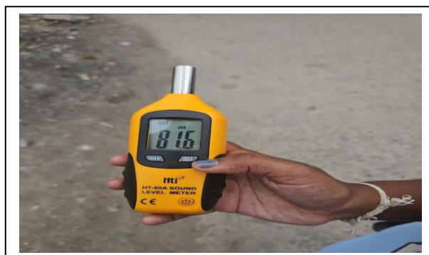
Fig.No.5 Monitoring of Noise level in Commercial Area

After Identifying different locations in Jewargi Town. Commercial areas such as Market area and Bus stand and Silence Zone. The readings are taken in morning, afternoon and evening hours. We have observed the readings from the table which varies from day 1 to day ,by considering the noise levels by taking into account of morning, afternoon & evening hours considering of Commercial area and Silence zone. The minimum noise level at Commercial area is 69.4dB and the maximum noise level is 88.01dB and the average is 78.77dB and at the Silence Zone the minimum noise level is 62.73dB, the maximum level is 75.31dB and the average is 69.11dB which is more than the limits compared to CPCB Standards. Result shows that,the noise should be identified as the major environmental problem and should take necessary steps to minimize it.