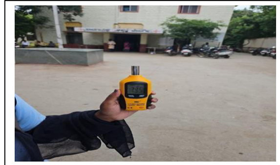
Fig.No.6 Monitoring of Noise level in Silence Zone