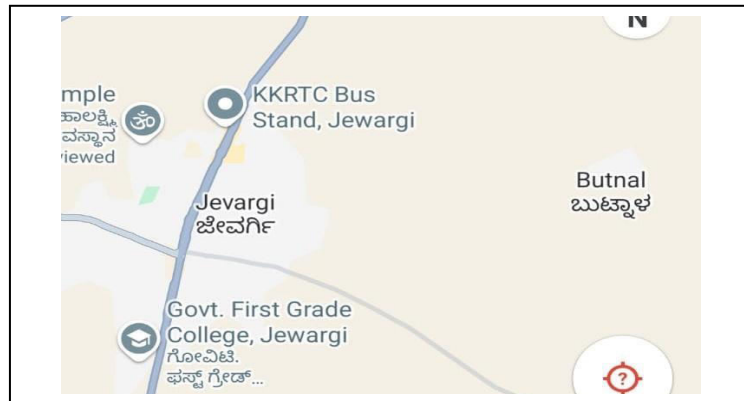
Fig No:2 Represents the Commercial Area (Jewargi)