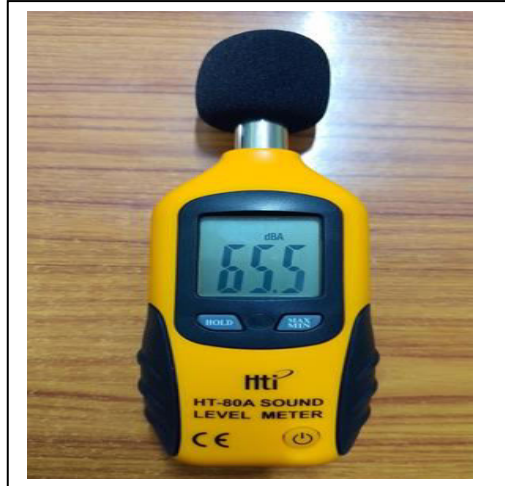
Fig No:4 Represents the Decibel meter